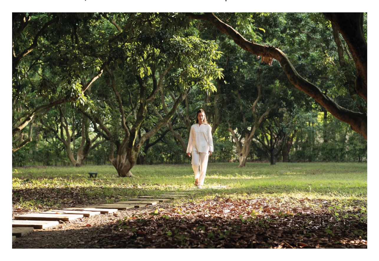
BOOK IT: Wellness at Vana

The biggest 2021 travel trend of all though is the demand for long immersive stays, aiming to spark transformation, and address deep-rooted fears and anxieties. Many Spas and retreats are offering long stay programmes, like <u>Absolute sanctuary</u> in Thailand, but none are more curated and finely tuned to your needs than at <u>Vana</u> in India, where you can stay for up to three months. There, there is an assembly of experts – Ayurvedic doctors, yoga teachers, Tibetan healers, fitness experts, acupuncturists and a strong staff of therapists to help you get your life back on track. There is also Buddhist healing and learning in tandem with Ayurvedic nurturing, all complemented with Chinese Medicine. And if the last ten months or so has taught us anything it's that health is indeed wealth, and we must do all we can to optimise our overall wellness.