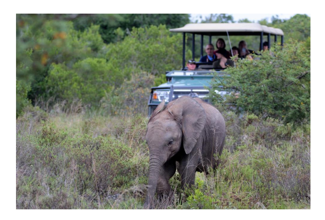
BOOK IT: South Africa for all the family

Africa Travel (020 7843 3500) can arrange a <u>family holiday to South Africa</u> from £7,990 per family of two adults and two children under 10yrs sharing, which includes flights with British Airways, a hire car, three nights with breakfast at the Palace Of The Lost City in Rustenburg, three nights with breakfast at the Table Bay Hotel in Cape Town, three nights with breakfast at the Fancourt Hotel on the Garden Route and two nights on safari with all meals and safari activities in the Amakhala Game Reserve at Hlosi Lodge